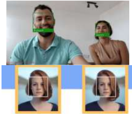
Fig. 3. Face detection in python

face. We also become better to the point where we can recognize faces in hazy videos.