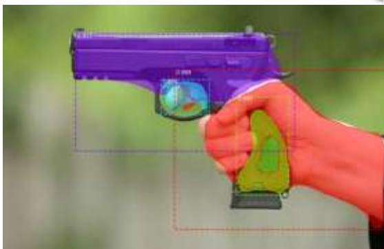
Fig. 4. Weapon detection in python