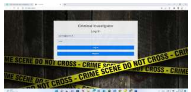
Fig. 6. Web application