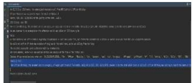
Fig. 5. Content summarizer

The police report or record is summarized on the other side. We all are aware that a police report or criminal report has lengthy paragraphs and circumstances. As a result, reading the record and acquiring a sense of the occurrence takes a lot of time for the officers under this approach, when a police officer enters any police report or document into the system, it summarizes the extensive context and outputs the most significant and helpful lines or ideas to the officer. Officers can therefore quickly read the written summary and understand it. They only need to spend a short amount of time on this. In order to find the most challenging facts in documents, this study illustrates a programmed method for reflecting all accessible information using non-fuzzy ideas on a range of extracted data. This is highly unique to our study project since the recommended method, which employs a small number of fuzzy rules, may evolve, and be used with emerging intelligent robots that can assess writing.